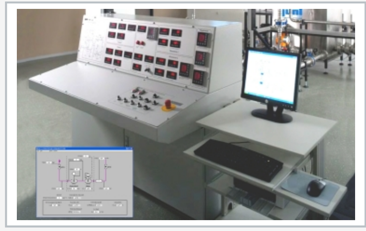
Control station consisting of control console and data acquisition for convenient recording and analysis of the experiments