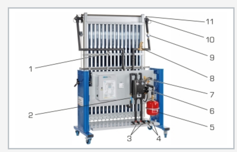
1 pressure sensor, 2 shut-off valve, 3 connectors for hot water, 4 connectors for cold water, 5 diaphragm expansion vessel, 6 circulation pump, 7 pressure relief valve, 8 bubble separator, 9 flow sensor, 10 temperature sensor, 11 vent valve