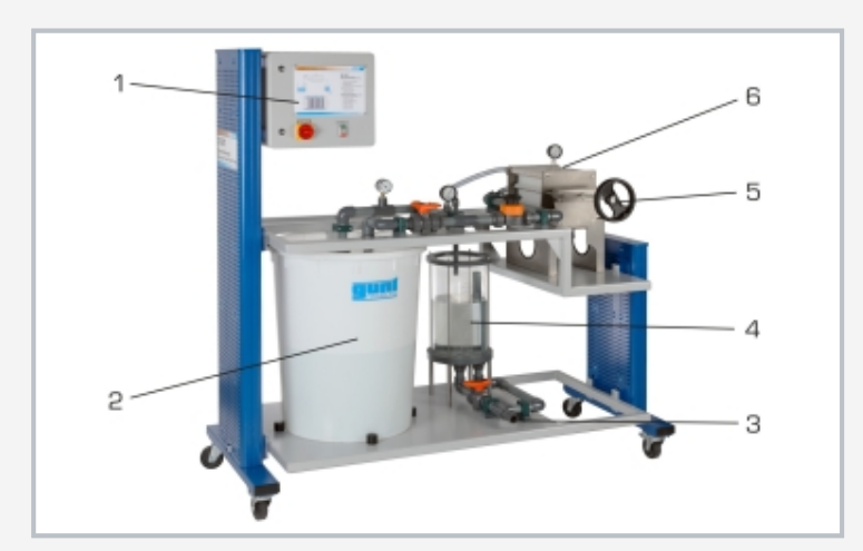
1 switch box with controls, 2 suspension tank, 3 filtrate tank outlet and overflow, 4 filtrate tank, 5 spindle, 6 plate and frame filter press