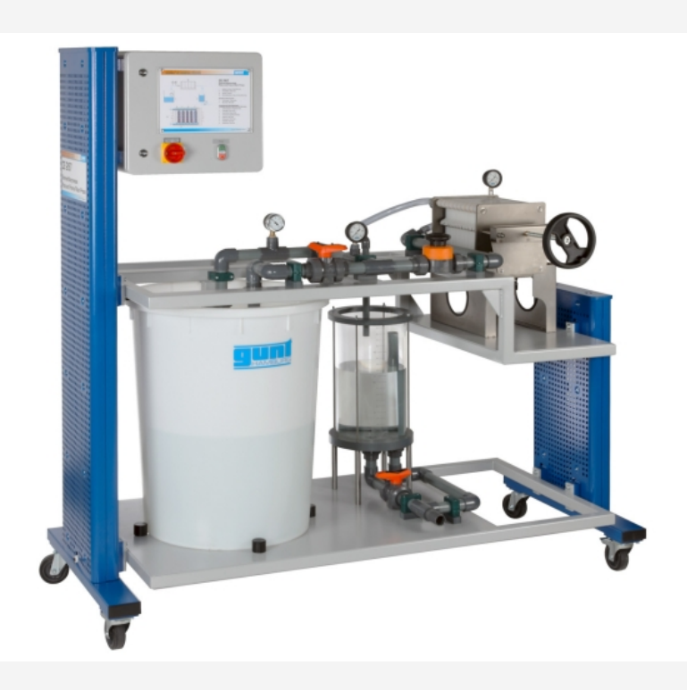
Plate and frame filter press