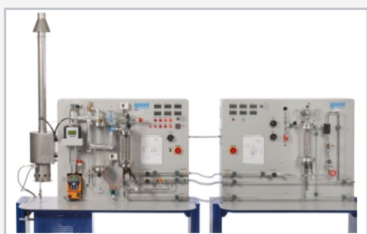
Left: ET 850 steam generator and right: ET 851 axial steam turbine; assembled ready for operation, together both units form a complete steam power plant