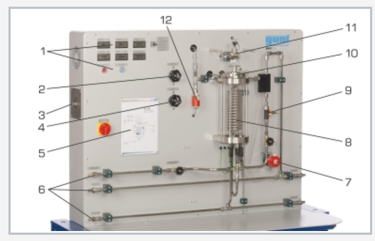
1 displays and controls, 2 valve for sealing steam, 3 steam connection, 4 valve for steam inlet, 5 process schematic, 6 water connections, 7 pressure sensor for condensate measurement, 8 condenser with coil, 9 cooling water flow rate sensor, 10 turbine, 11 eddy current brake, 12 pressure sensor