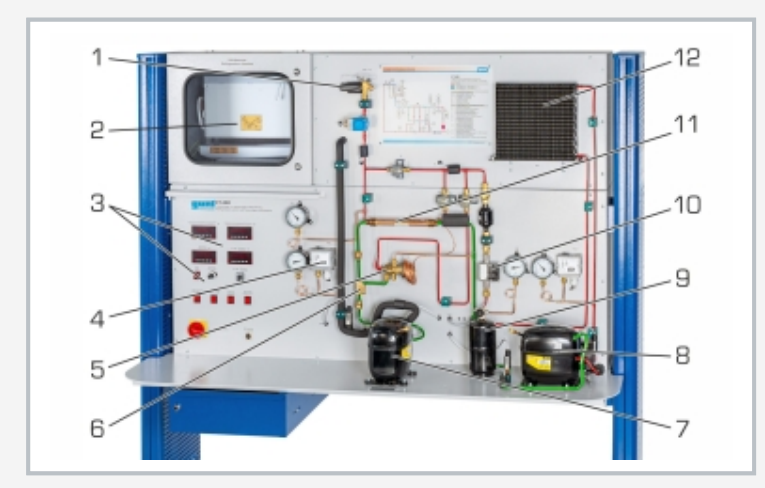
1 expansion valve, 2 refrigeration chamber, 3 displays and controls, 4 pressure switch, 5 injection valve, 6 injection cooler, 7 LP compressor, 8 HP compressor, 9 receiver, 10 flow meter, 11 heat exchanger, 12 condenser