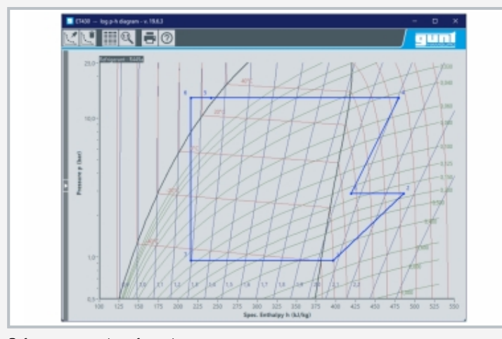
Software screenshot of a real system process 1-2 LP compression, 2-3 intercooling, 3-4 HP compression, 4-5 condensation, 5-6 supercooling, 6-7 expansion, 7-1 evaporation