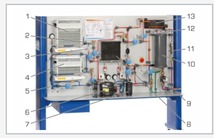
1 evaporator, 2 expansion valve, 3 capillary tube, 4 freezing stage evaporator, 5 evaporation pressure controller, 6 compressor, 7 receiver, 8 heat exchanger with fan, 9 pump, 10 tank for glycol-water mixture, 11 flow meter (glycol-water), 12 solenoid valve, 13 coaxial coil heat exchanger