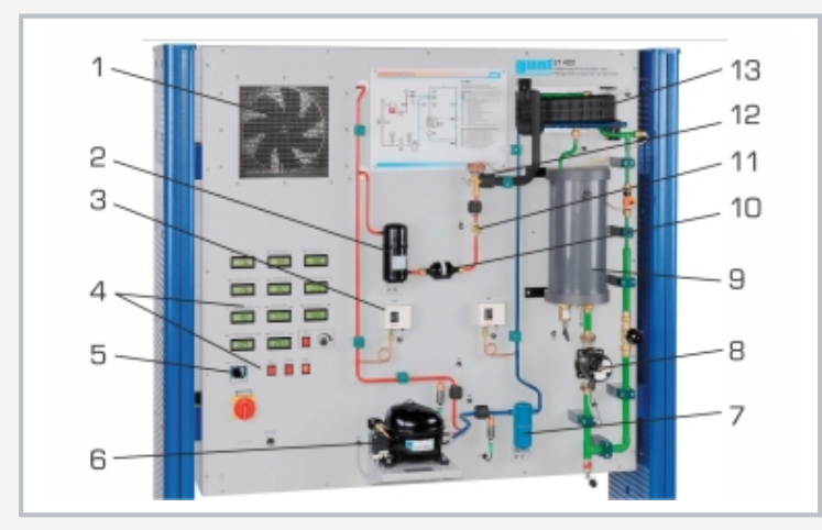
1 condenser with ventilator, 2 receiver, 3 high pressure switch, 4 displays and controls, 5 heater controller, 6 compressor, 7 liquid separator, 8 pump, 9 warm water tank with heater, 10 filter/drier, 11 sight glass, 12 expansion valve, 13 evaporator