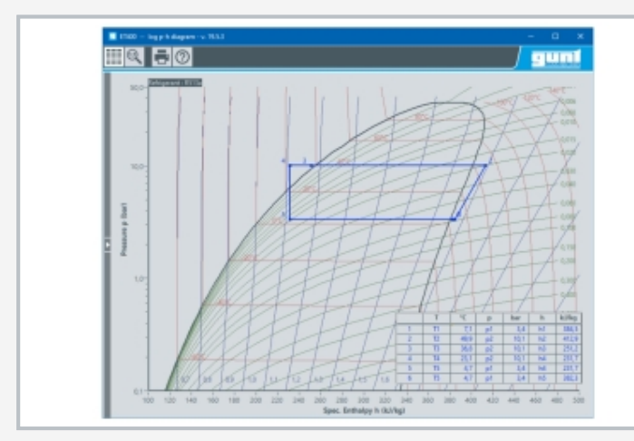
Software screenshot: log p-h diagram