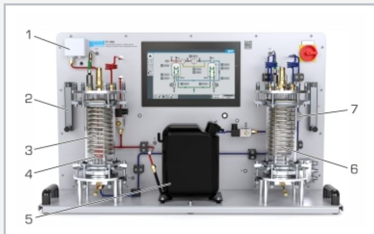
1 pressure switch, 2 flow meter, 3 condenser, 4 expansion valve, 5 compressor, 6 evaporator, 7 sight glass