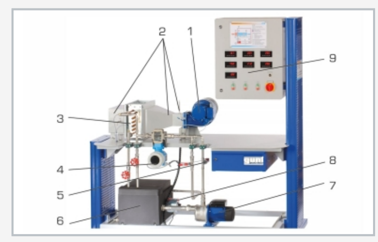
1 fan, 2 air duct with temperature measuring points, 3 heat exchanger, 4 flow meter, 5 pressure sensor, 6 water tank, 7 pump, 8 heater with thermostat, 9 displays and controls