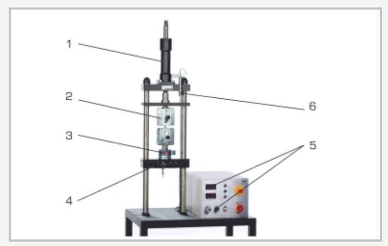
1 hydraulic cylinder for generating tensile and compressive forces, 2 operating area with the accessory WP 310.05, 3 force sensor, 4 adjustable height lower cross-member with lock, 5 displays and controls, 6 displacement sensor