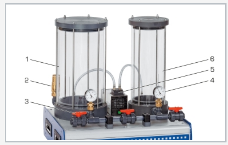
1 positive pressure tank, 2 safety valve, 3 ball valve, 4 manometer, 5 compressor, 6 negative pressure tank