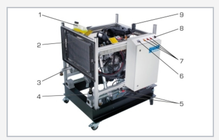
1 cooling water tank, 2 cooler with protective screen, 3 exhaust gas connection, 4 fuel tank, 5 battery with main switch, 6 operating time counter, 7 warning lamps, 8 key switch for ignition, 9 connection for engine feed air