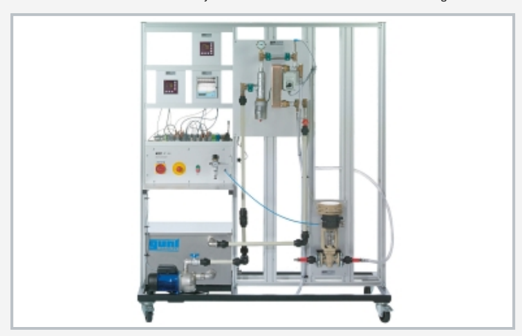
The illustration shows the layout of a temperature control system. In addition to the base module RT 450, it includes the following components: RT 450.04 (controlled system module: temperature), RT 450.11 (controller), RT 450.12 (recorder), RT 450.21 (control valve) and RT 450.36 (temperature sensor).