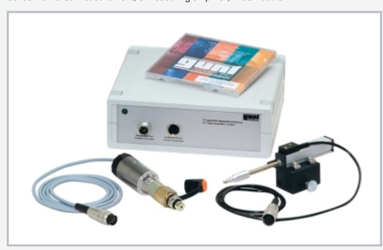
Assembled data acquisition system with software CD; in the foreground: left: pressure sensor, right: displacement sensor