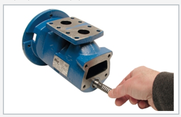
Assembly of the srew pump: assembling the valve piston with the valve spring